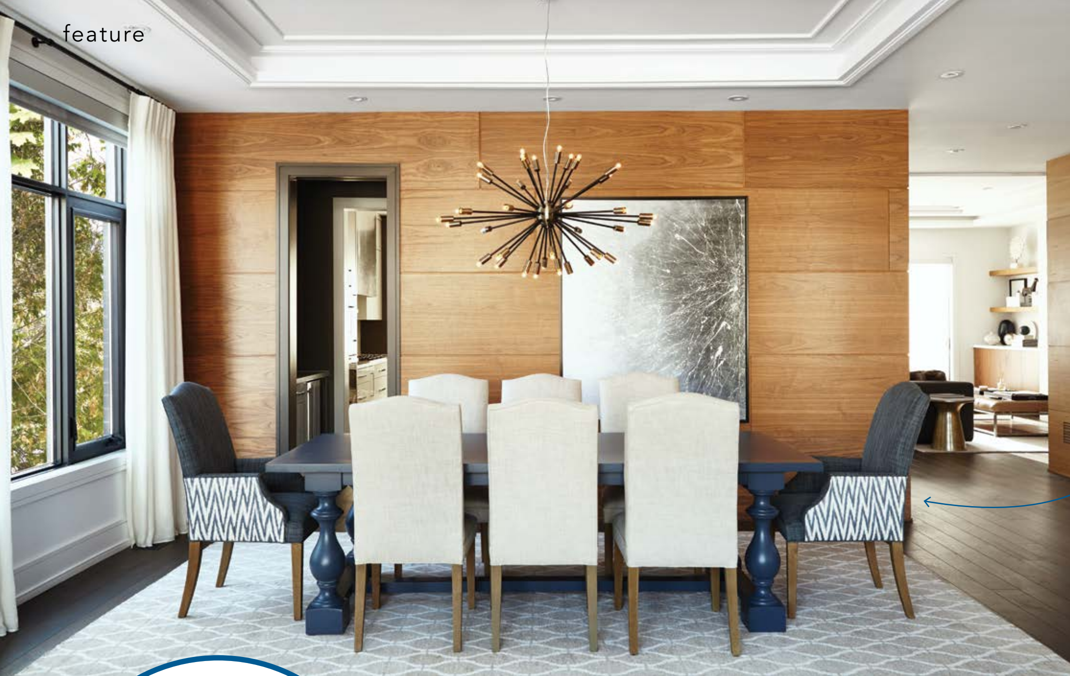
LEFT: The dining table was painted a beautiful deep blue. BOTTOM LEFT: Designtheory mavens Adolphina and Leanne worked with the homeowners to create a calm, soothing place to call home. RIGHT: Soft chevron patterned wallpaper in the powder room adds personality. BELOW: The two-sided fireplace is a beautiful focal point on the main floor.

The armchairs were reupholstered for a modern feel.