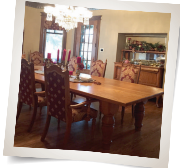
The dining room prior to the redesign of the space.

⚡ Tied-back floral, linen and silk drapery was designed to maximize the light filtering through the room and showcase the beautiful stained glass.